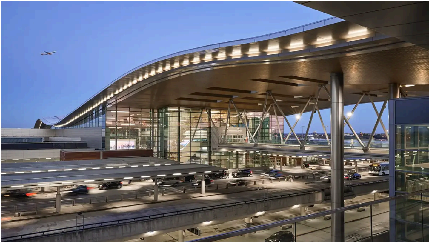
Nashville International Airport, BNA Vision: Terminal & Landside Area Planning.