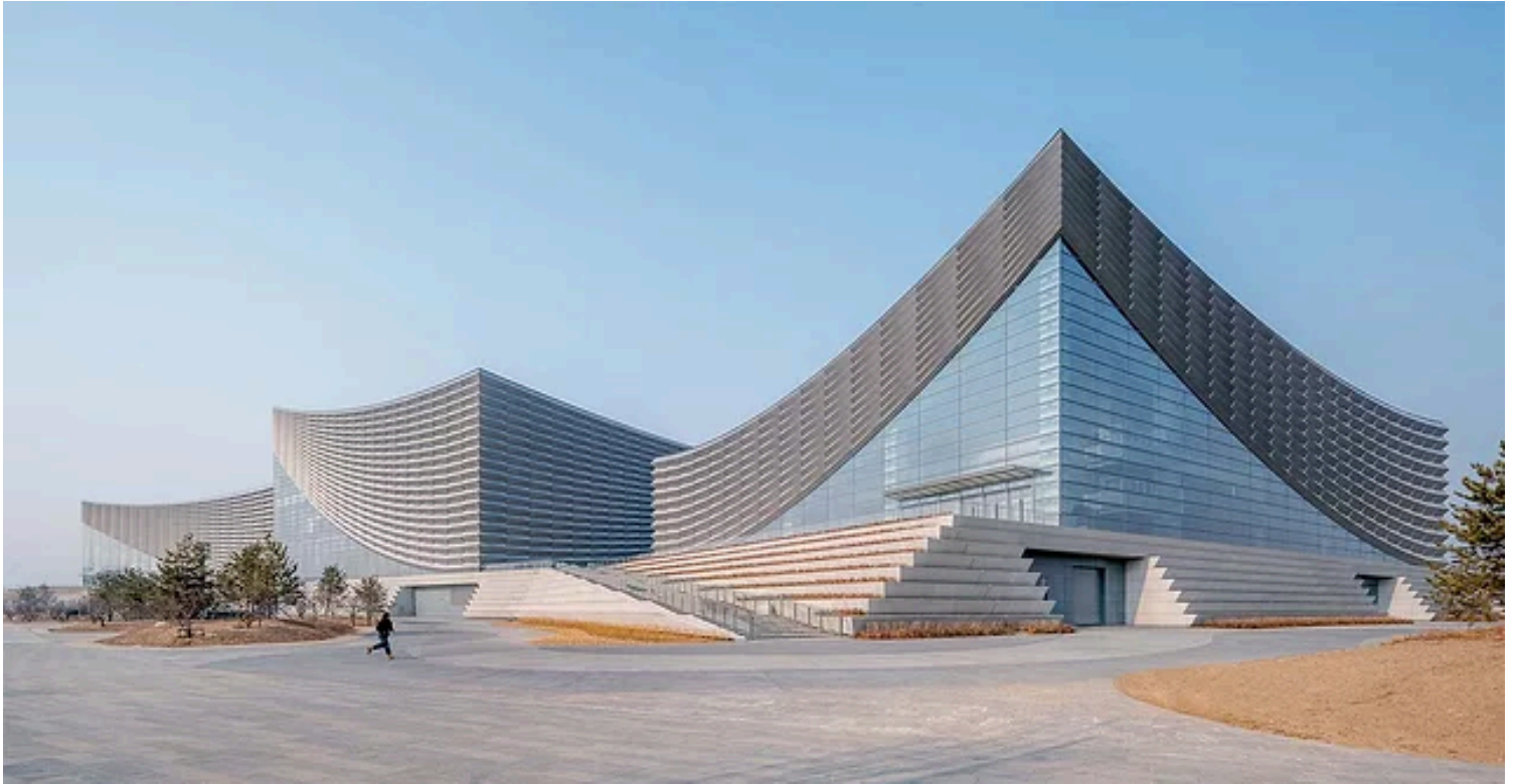
Beijing Performing Arts Centre by Perkins&Will and Schmidt Hammer Lassen.