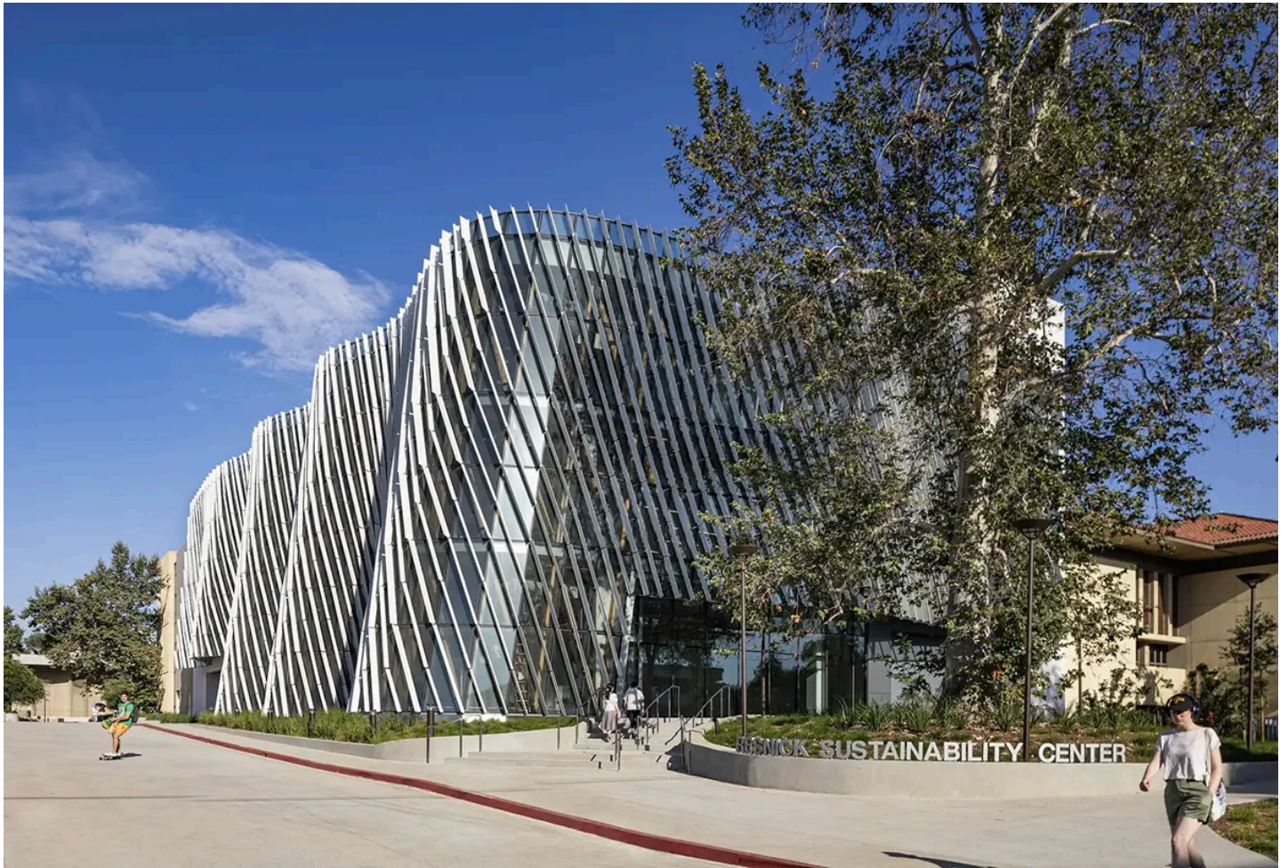
California Institute of Technology Resnick Sustainability Center, Pasadena, by Yazdani Studio of CannonDesign.

climb into it, including VLK Architects, moving from 39th place to 22nd, and LS39 Associates, which squeaked into the 24th spot from the firm's previous position at 28. (Ware Malcomb and NORR both fell out of the top 25.)