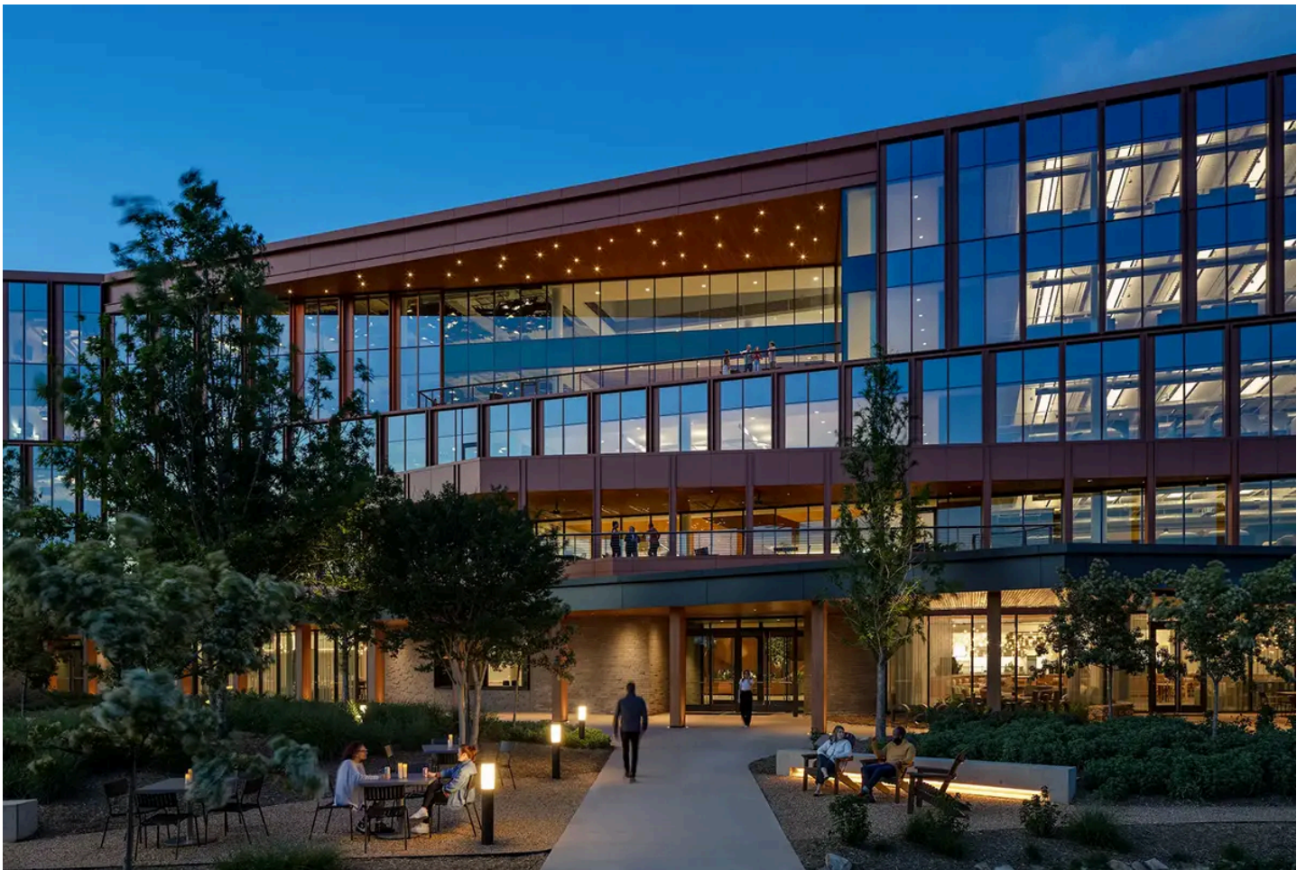
Bandwidth Headquarters, Raleigh, by Gensler. click to enlarge.

Unlike the weather, fashion, and the price of gas, the upper ranks of RECORD's annual Top 300 American architecture firms by revenue list aren't all that prone to change. For the sixth consecutive year, Gensler and Perkins&Will have held their spots at the top of the list, at one and two, respectively, with Gensler reporting $1.86 billion in architecture revenue and Perkins&Will $720 million, based on 2024 data provided by the firms. Both figures represent increases from the revenues reported in 2024. Like last year, HKS reported the third-highest revenue of $662 million, up from $556 million. There wasn't much movement either slightly farther down the list, with most of the top 25-placing firms—Jacobs, HDR, AECOM, Corgan, Populous, Stantec, CannonDesign et al.—either holding steady in the same positions or ascending or dropping a spot or two (or four, in the case of Perkins Eastman, which slid from 14th to 18th).