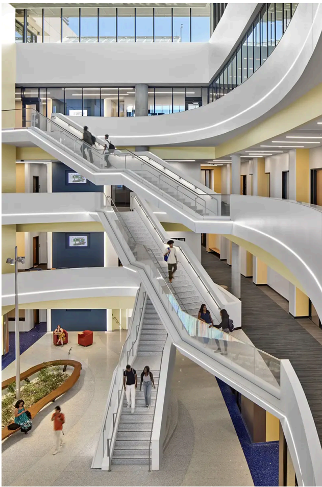
Morgan State University Health and Human Services Building, Baltimore, by HOK.