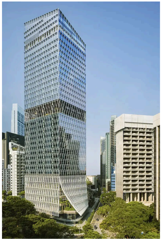
Keppel South Central, Singapore, by NBBJ.