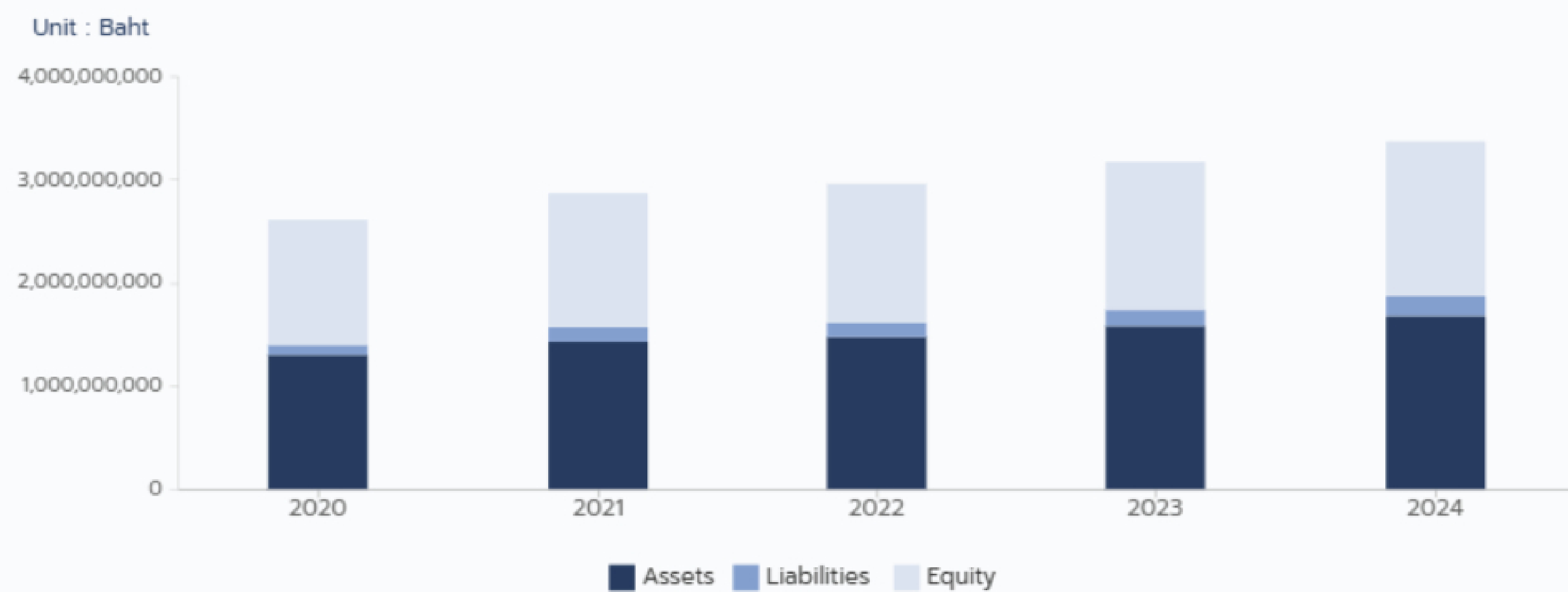
Balance Sheet Proportion