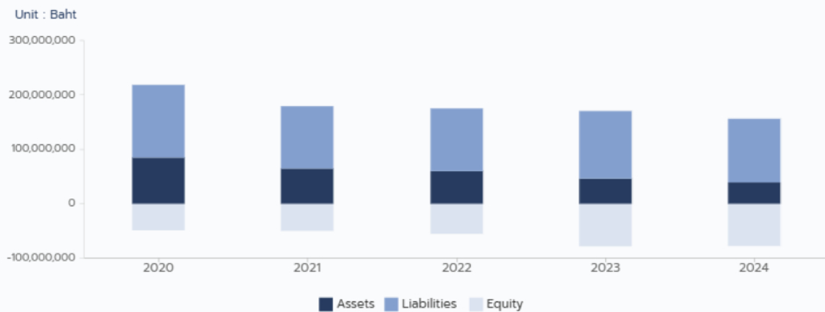
Balance Sheet Proportion