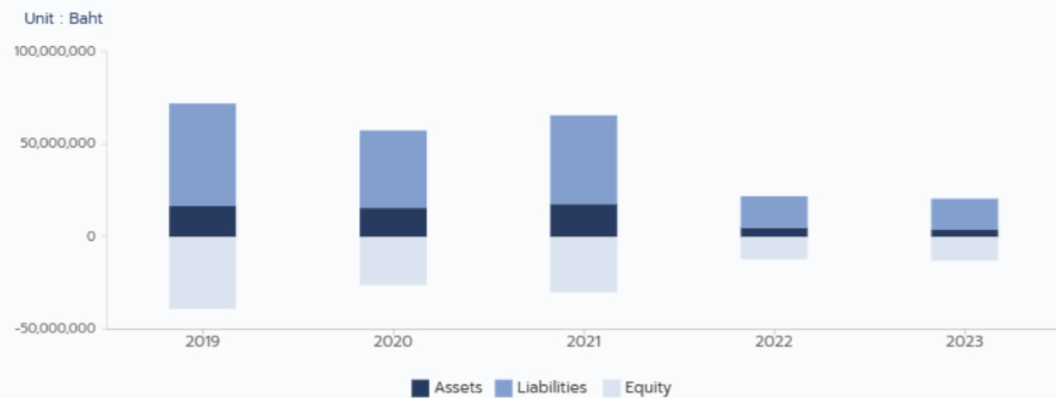
Balance Sheet Proportion