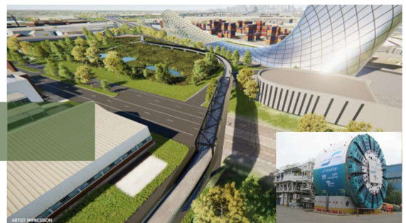
CPBJH JV- West Gate Tunnel Project