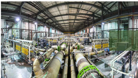
CPB - Victorian Desalination Plant