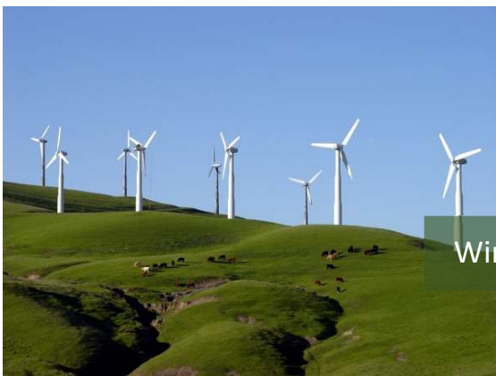
Wind Farms (Mt Mercer, Mt Gellibrand, Beaufort etc)